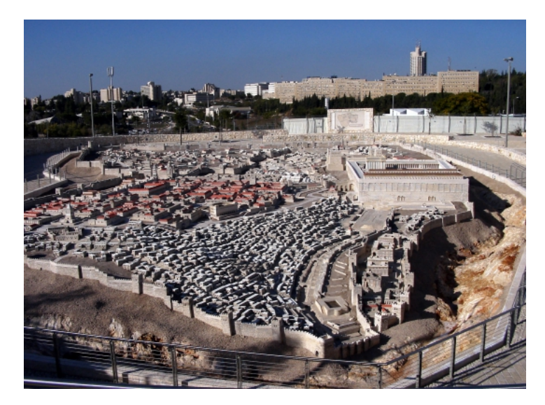
Fig. 5. Jerusalem, Israel Museum, Holy Land Hotel Model of Herodian Jerusalem. Photograph by Annabel Wharton, 2006.

What the museum does not include in its brochure or on its website is the fact that many of its objects—including most of the Dead Sea Scrolls—making up this Jewish narrative were once held by the Palestine Archaeological Museum (officially renamed the Rockefeller Museum after the Six-Day War), where the story that they were arranged to tell was very different.