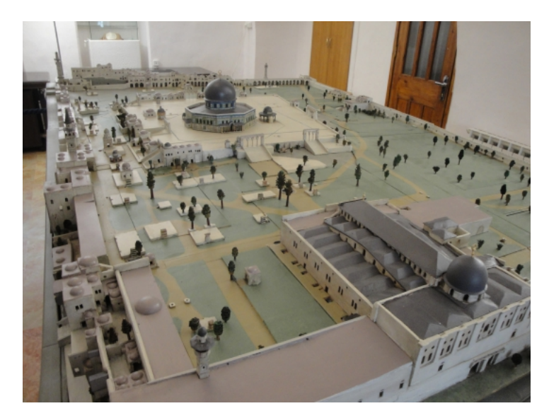
Fig. 1. Model of Jerusalem's al-Haram al-Sharif by Conrad Schick.

books. In such a way we come to the Pre-Israelite peoples in Palestine. Thence on one hand to specific Hebrew history, and on the other to the presentment of the great succession of historic cultures, which have surrounded and in various measures affected, both Hebrews and Palestine generally. Begin then with a large Museum Hall for Egypt... The simple visitor should thus see as he entered a good relief model of the whole Egyptian region, with [a] realistic Nile flowing from its reservoirs in the Great Lakes to its outlet on the Sea. Here recall the magnificent realism of the models and panoramas so characteristic of the Paris Exhibition of 1900... [H]ow attractive will be a series of good Relief Models of Jerusalem, illustrating, as far as may be, the extent and character of the city from its earliest Jebusite days, to its glories under David, its greatness under Solomon, and so on throughout its checkered history (Fig. 1).<sup>4</sup> In the sketch it will be noted that those Galleries, namely: (1) those of Geography, (2) general history, and (3) of Hebrew and Jerusalem history, all lead into a final Gallery, for the renewing Palestine with its developing Cities and Capital.<sup>5</sup>