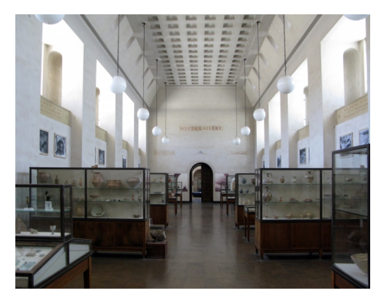
Fig. 2. Jerusalem, Palestine Archaeological Museum, north gallery.

Like its funding and its administration, the project of the museum was Western: the museum's artifacts were ordered not to prove the truth of the Hebrew Bible, but rather to track the West's teleological ascent to modernity. In the chronological arrangement of the museum's wealth of artifacts, the Hebrew phase of history was documented, but received no special attention-it was just one of a succession of societies from the Mesopotamians and Egyptians to Islam that provided the foundations for the cultural achievements of Euro-American man. Breasted's program complemented the cultural assumptions of the museum's American benefactor and the interests of its British proprietors. The political conditions have changed dramatically since the museum's opening. After the Israeli occupation of East Jerusalem during the Six-Day War, the Palestine Archaeological Museum with its history of Western cultural evolution was displaced by the Israel Museum with its emphasis on the region's religio-national Jewish heritage.<sup>10</sup> In the Israel Museum, the first set of galleries splendidly display the museum's archaeological collection (Figs. 3 and 4). Though objects representative of the regional cultures from pre-historic times through the early middle ages are exhibited, artifacts of Jewish origin are emphasized. The museum's visitor's brochure describes the exhibition: