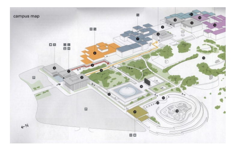
Fig. 3. Jerusalem, Israel Museum, plan from the museum's public brochure. 1, Entrance; 6, Youth Wing; 7, Archaeology; 11, Jewish Art and Life; 13–14, Israeli Art/Fine Arts; 16, Shrine of the Book; 19, Holy Land Hotel Model of Jerusalem.

Here [the model of Herodian Jerusalem] provides a three-dimensional contextual illustration for the period documented by the Dead Sea Scrolls, when Rabbinic Judaism took shape and Christianity was born. It also makes a striking visual connection to the Shrine of the Book and to the nearby Knesset, the National Library, and the Supreme Court, symbols of modern Jewish statehood.<sup>12</sup>