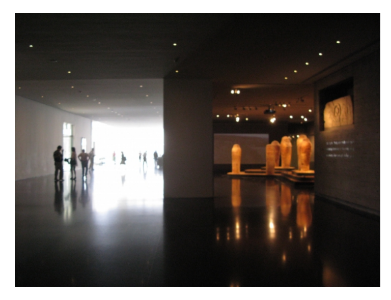
Fig. 4. Jerusalem, Israel Museum, view of the exhibition of anthropoid sarcophagi. Photograph by Annabel Wharton, 2006.