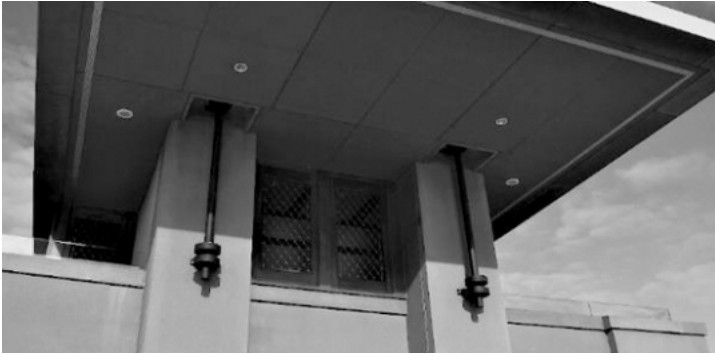
Fontana Boathouse, Buffalo NY, built in 2007 based on designs executed in 1905 and 1930 by Frank Lloyd Wright.