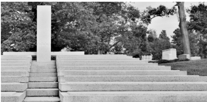
Blue Sky Mausoleum, Buffalo NY, built in 2004 based on a design executed in 1925-1928 by Frank Lloyd Wright.